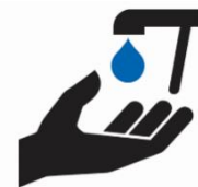
Hand sanitising station

Due to the relatively small numbers of students in school, many rooms are only used by one class during a day. When a classroom is being used by more than one class in a day, your teacher will give you a surface wipe which you can use to wipe their own desk, (keyboard/mouse) and chair. Washing your hands immediately before entering the building to go to a lesson, avoiding touching your face during lessons and washing your hands again as after you have left a lesson to go to break or lunch means that touching a keyboard or mouse should be safe, but we do have disposable gloves if you would like to wear them.